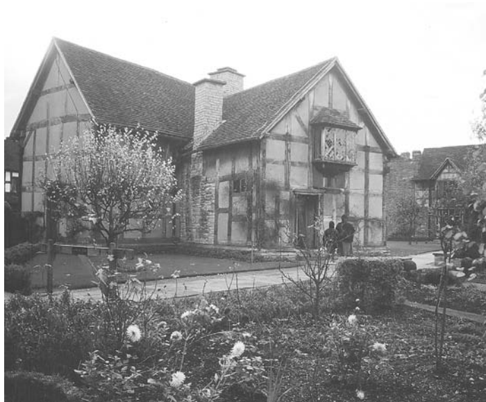
Shakespeare’s birthplace in Stratford-upon-Avon.

Little is known about Shakespeare’s early life. His mother, Mary Arden Shakespeare, was from a well-to-do, well-connected family. His father, John Shakespeare, was a prosperous glove maker and local politician. William’s exact birthdate is unknown, but he was baptized in his hometown of Stratford-upon-Avon on April 26, 1564, and tradition has assigned him a birthdate of April 23, which was also the day of his death and the feast day of Saint George, England’s patron saint.