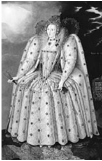
Portrait of Queen Elizabeth I.

A comedy is typically lighthearted, though it may touch on serious themes. Action in a comedy usually progresses from initial order to humorous misunderstanding or con-