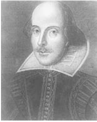
Engraving of William Shakespeare from the First Folio.