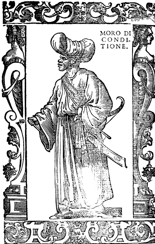
Illustration of a Moor from Degli abiti antichi et moderni (1590) by Cesare Vecellio.

The Moors were a Muslim people who lived on the northern coast of Africa, an area the Europeans called Barbary. These people had a mixed heritage: they were descended from the Berbers (a Caucasian people native to north Africa) and the Arabs, who came from the east. In the eighth century, the Moors invaded Spain and brought it under Islamic rule, in the process bringing to Western Europe their vast knowledge of art, architecture, medicine,