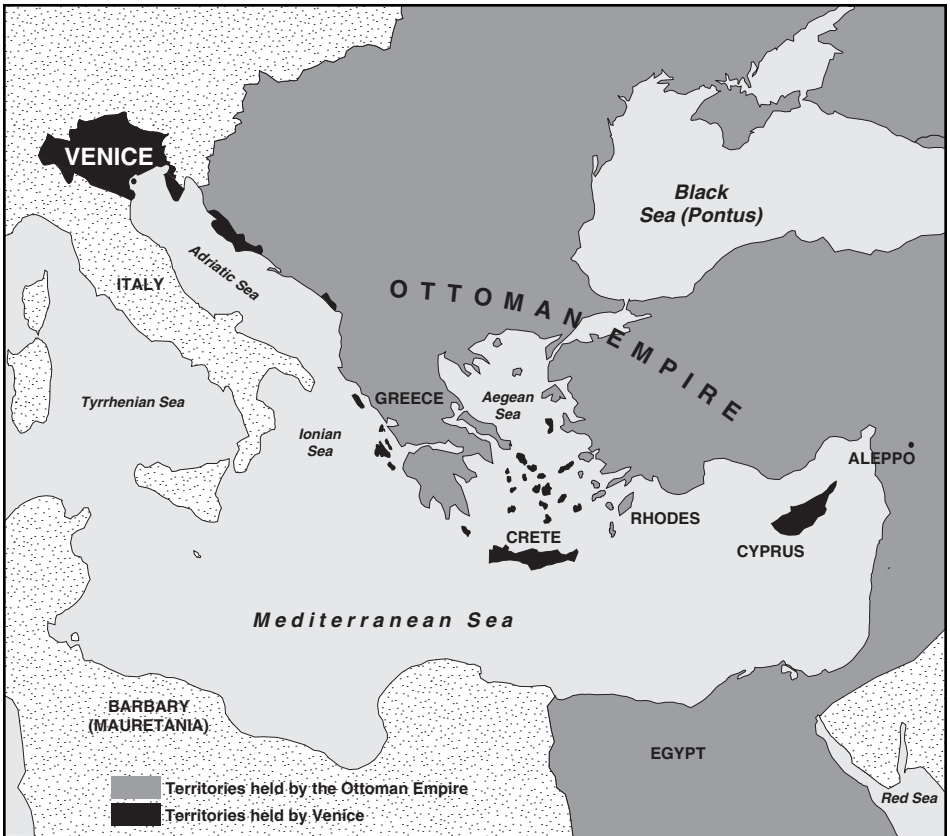
Map showing territories held by Venice and the Ottoman Empire in the 16th century.

There is no record of Shakespeare having traveled to Venice, so it is likely that he relied on books to help him create an accurate picture of Venetian life. One source he