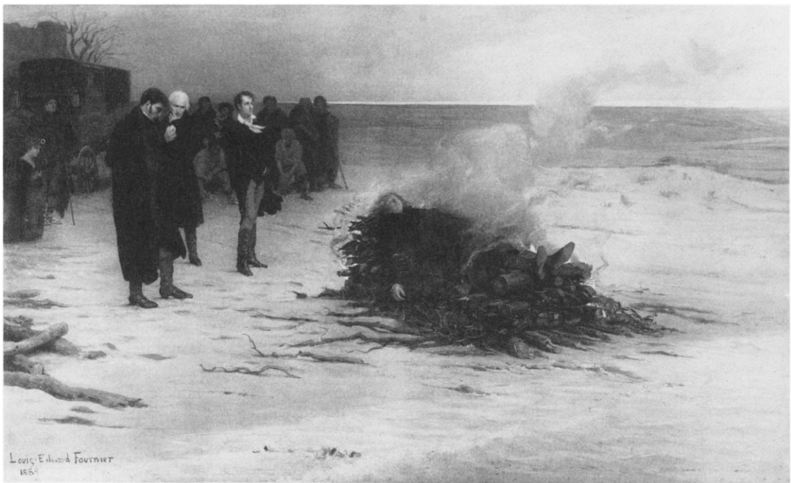
Fig. 2. The Funeral of Shelley , by Louis-Edouard Fournier. 1889. Walker Art Gallery, Liverpool.