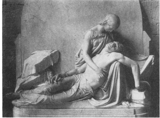
Fig. 1. Monument to Percy Bysshe Shelley and Mary Wollstonecraft Shelley, by Henry Weekes. Christchurch Priory, Dorset.

Weekes's sculpture, with its self-conscious borrowings from Christian iconography, calls attention even more insistently to the display of